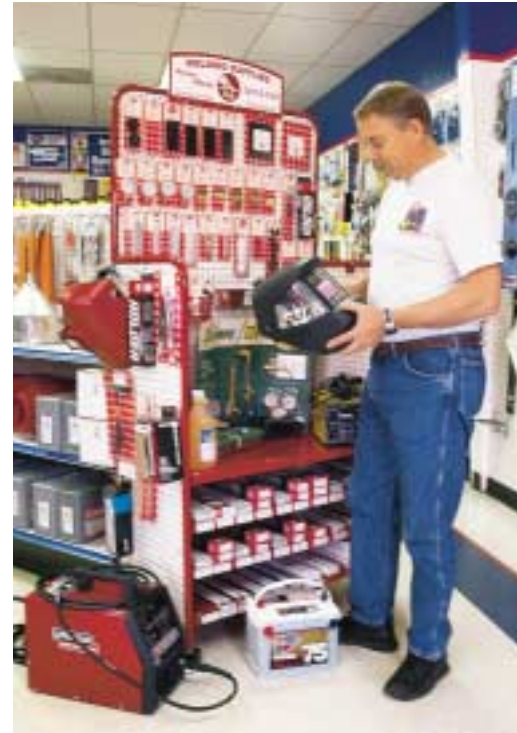
Farm & Shop display

Today, via a network of over 500 Farm & Shop distributors throughout the Southeast, welding supplies are available to small shops, farmers, hobbyists and do-it-yourselfers.