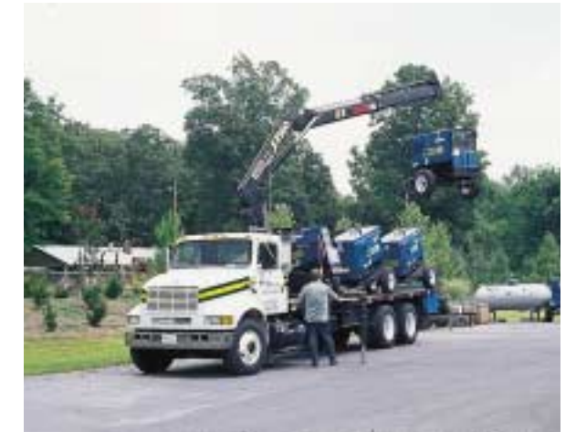
Loading rental machines

Performance Plus, our preventive maintenance and calibration certification program, will give you the competitive edge needed in today's welding industry. This program offers complete support for welding machines, welding robots, cutting machines and automation cells, ensuring ongoing efficiency of your equipment, preventing problems before they start. Our technicians will clean, inspect, and calibrate your machines on a semi-annual or annual schedule. With international standards becoming more critical to global manufacturing, this program supports the calibration needs as required for ISO certification.