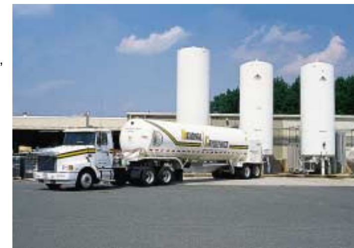
Gases manufactured at our plants are ready for delivery in packages ranging from small high pressure cylinders to large cryogenic bulk tanks.

To facilitate continuous product availability, we carefully monitor all deliveries. Cryogenic gases are delivered to our customers' sites via a dedicated fleet of liquid transport trailers. Storage of delivered gas is accomplished via product specialty bulk vessels which are owned and maintained by National Cryogenics. We also maintain 11 miles of pipeline supplying six large industrial users directly from the air separation plants.