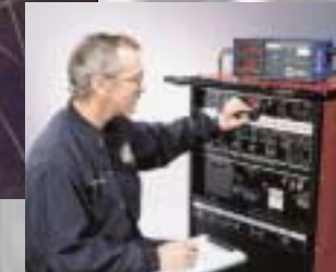
Rental & Repair