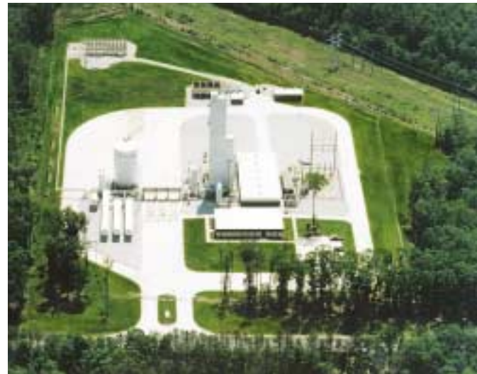
Harvesting the atmosphere

All gases are produced under the most exacting conditions assuring their purity complies with USP and FDA industry standards and CGA guidelines.