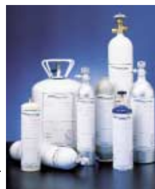
High quality gases