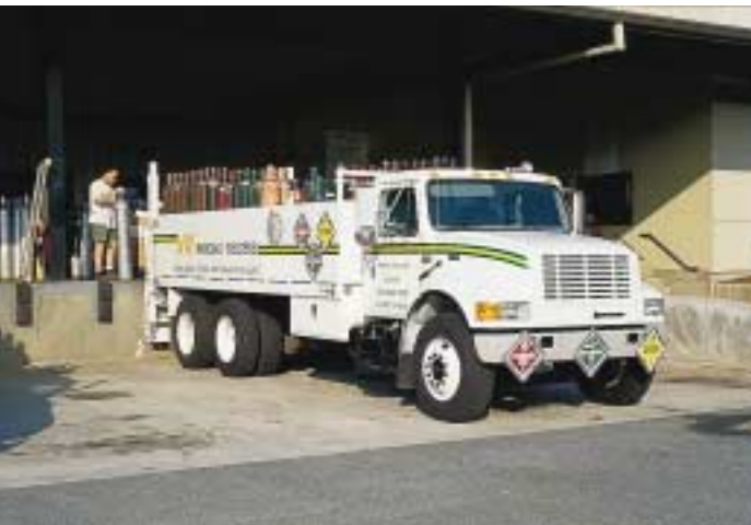
Preparing route vehicle for deliveries.

Additionally, we market and sell safety supplies through our central shipping and telemarketing division.