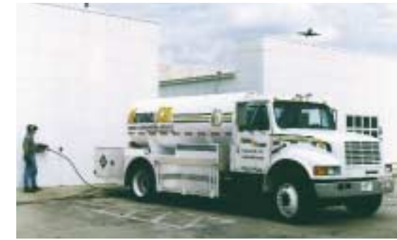
Filling at a restaurant.

Our Liquid Carbonation Systems are used in thousands of restaurants, convenience stores, fast food chains and public arenas throughout the Southeast, including Charlotte's own Ericsson Stadium and Charlotte Coliseum. National Welders technicians maintain each location, and our specialized carbon dioxide fleet assures competent delivery.