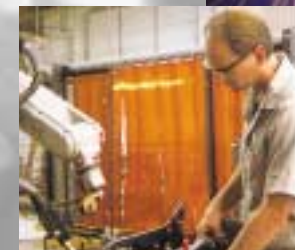
Specialized Equipment & Engineering, Robotics, Tooling