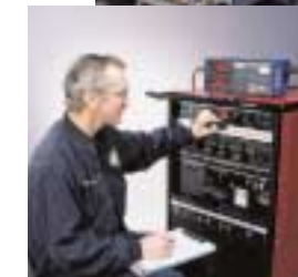
Performance Plus technicians