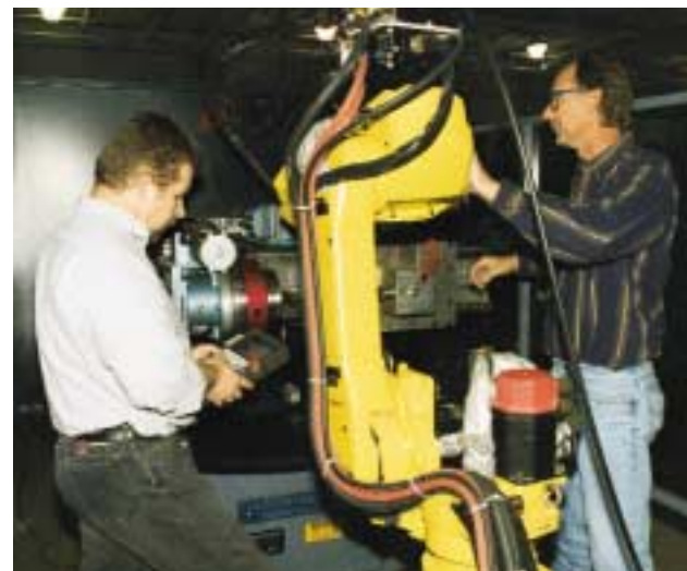
Working with you as a partner

SE&E can meet all your welding automation needs as an integrator for many robotic and automated systems. Our turnkey consulting, designs, and installations deliver state-of-the-art automation to your manufacturing processes, including robotics, welding equipment, tooling, positioners, programming and training.