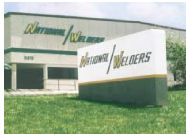
Gas & Equipment Service Centers

Our employees share the responsibility for quality assurance in process, product and service. Teamwork results in a continued increase in process capabilities and promotes solid growth in our overall quality journey.