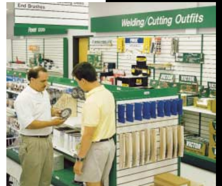
Technical Support is an added value for our customer.